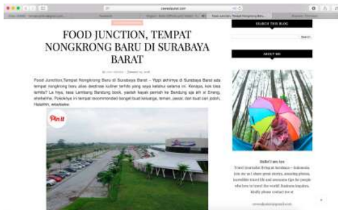
Figure 2: Inayati's writings are used as reference sources for national online news sites

One of Inayati's works has even become a trending topic in society. This was because his writing was recommended by one of the national online news sites. So the visits to his blog at that time increased very much. Inayati never thought that her writing would become a source of reference for national online news sites.